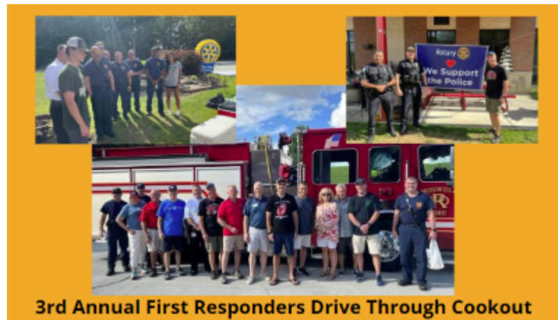
3rd Annual First Responders Drive Through Cookout

This week we remember the 2,977 people who lost their lives on September 11, 2001 in the single largest foreign attack on American soil. We honor the memory of 441 first responders - fire, police and EMS - who died that day trying to rescue those trapped in buildings that had been hit, the greatest loss of emergency responders on a single day in American history.