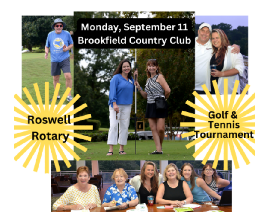
Add To Calendar

Committee Meets every Thursday at 11:30am before Rotary at front of gym