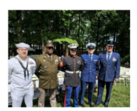
Memorial Day - Sun Came Out!